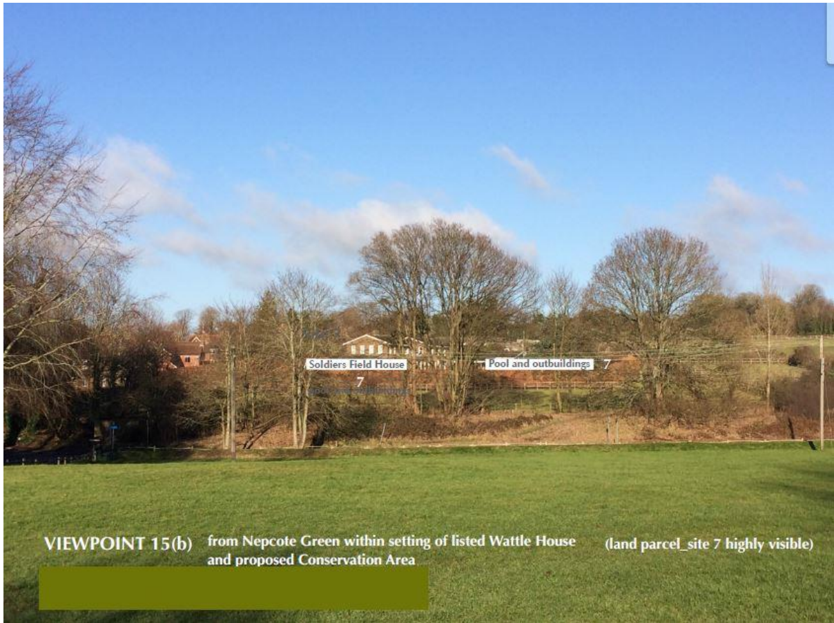
VIEWPOINT 15(b) from Nescote Green within setting of listed Wattle House and proposed Conservation Area (land parcel_site 7 highly visible)