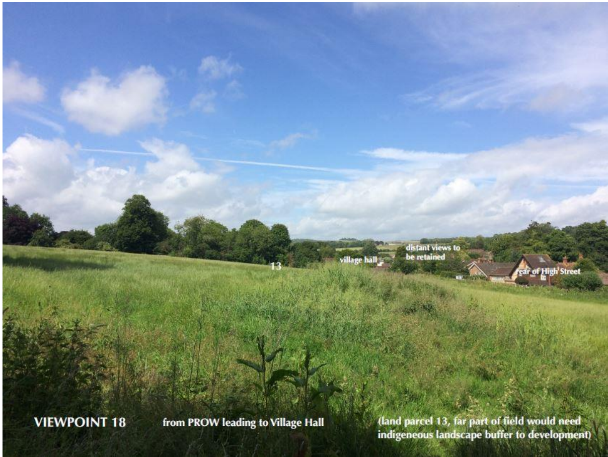
VP18 From Monarchs Way field PROW looking towards Village Hall and Gallops Farm