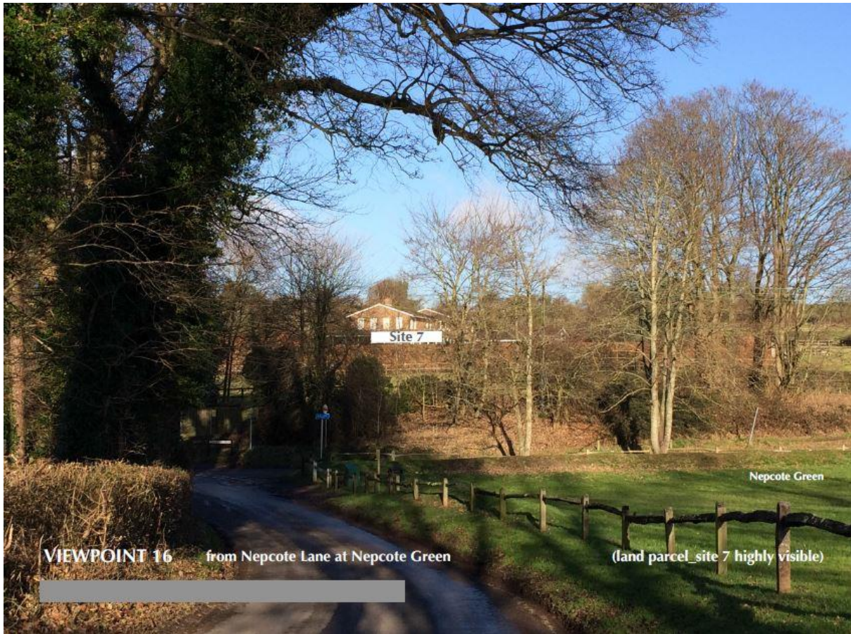
VP16 From Nepcote Lane looking towards Soldiers Field House