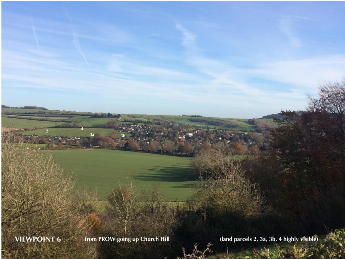
VP6 From lower slopes of Church Hill PROW looking towards Chanctonbury Ring