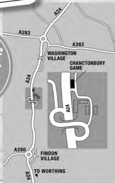
How to find us