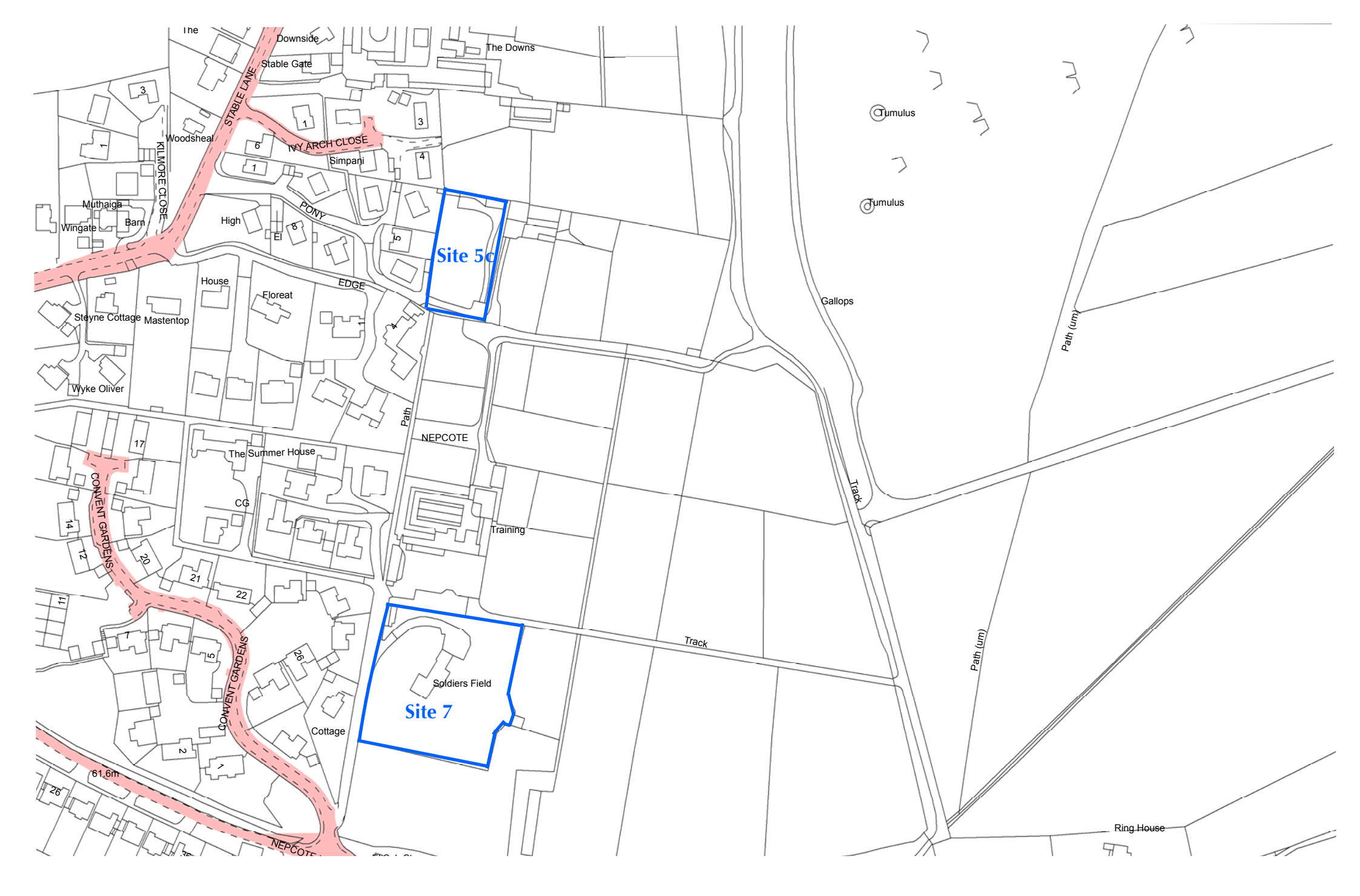
Site 5c Site 7