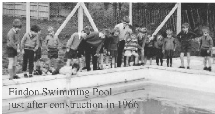
Findon Swimming Pool just after construction in 1966