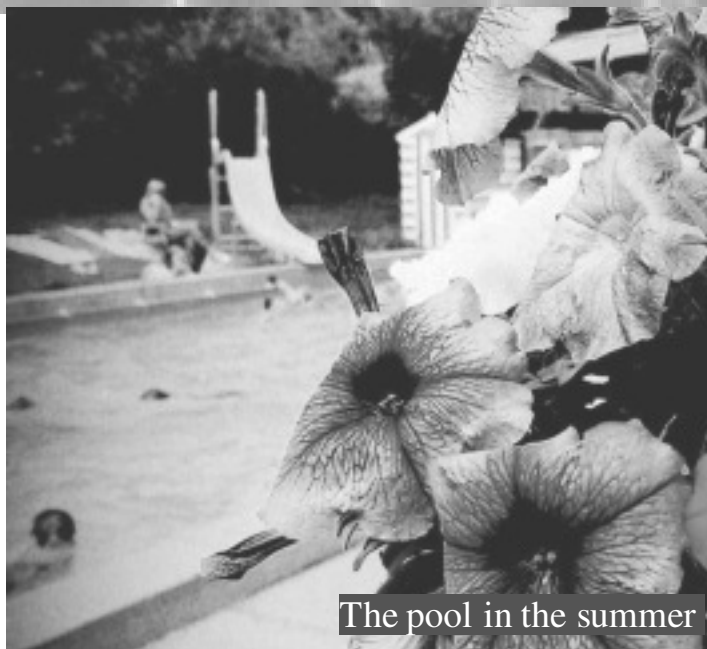
The pool in the summer

Findon swimming pool has been managed since its construction by a committee of volunteers responsible for all aspects of running such a facility from water testing, maintenance, membership, pool hire, publicity and fundraising. Over the years, hundreds of volunteers have been involved in the smooth running of this unique facility. Through the summer months from May to September, the pool is usually open to the public after school hours, 6 days a week, although opening hours are reliant