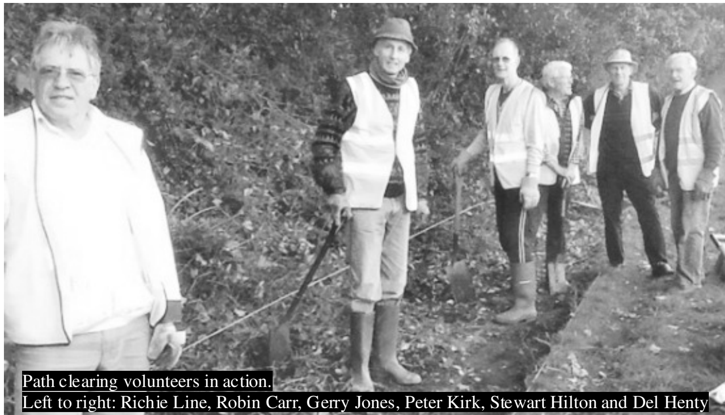
Path clearing volunteers in action.