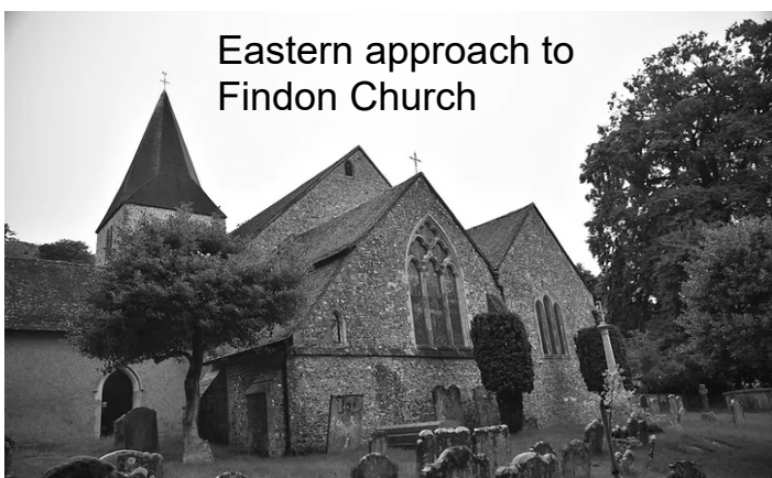
Eastern approach to Findon Church