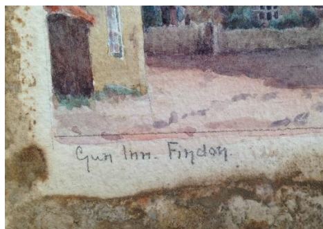
Under the mount